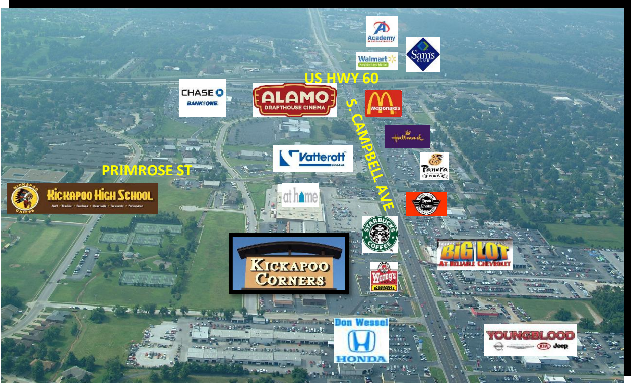
Kickapoo Corners View to the South